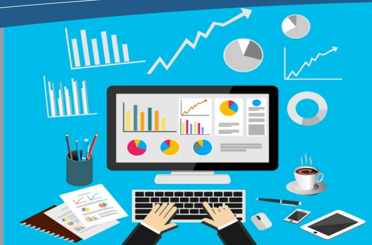
Tableau Desktop Free for University Students

If you're not a member already and you're interested in receiving the BICoP newsletter and communications regarding Business Intelligence, submit an email to bicp@yale.edu and we will gladly include you!